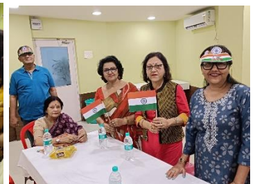
Pre-Independence day celebration after BOD meeting on 10 Aug

We remain true to the purpose and values over the years in a proactive and agile way for sustainable service to the society.