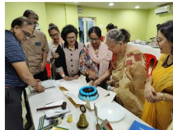
Cake cutting on 25Aug for induction celebrations of new RCC at Panarhat